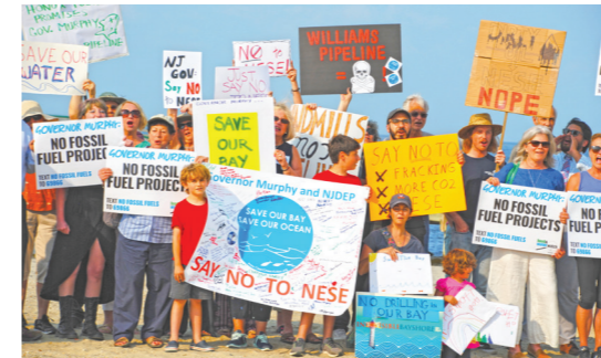
Citizens Stand United on Beach at Raritan Bay and tell Gov. Murphy to Permanently "Say No" to NESE

The outpouring to defend the bay and ocean is inspiring. Together, COA citizens, businesses, and towns have worked hard and spent millions to improve these waters. The whales, fish, clams, seal and people are all back enjoying the cleaner water. COA will fight any proposed harm to these remarkable and valuable resources. Governor Murphy must send Williams back to Oklahoma.